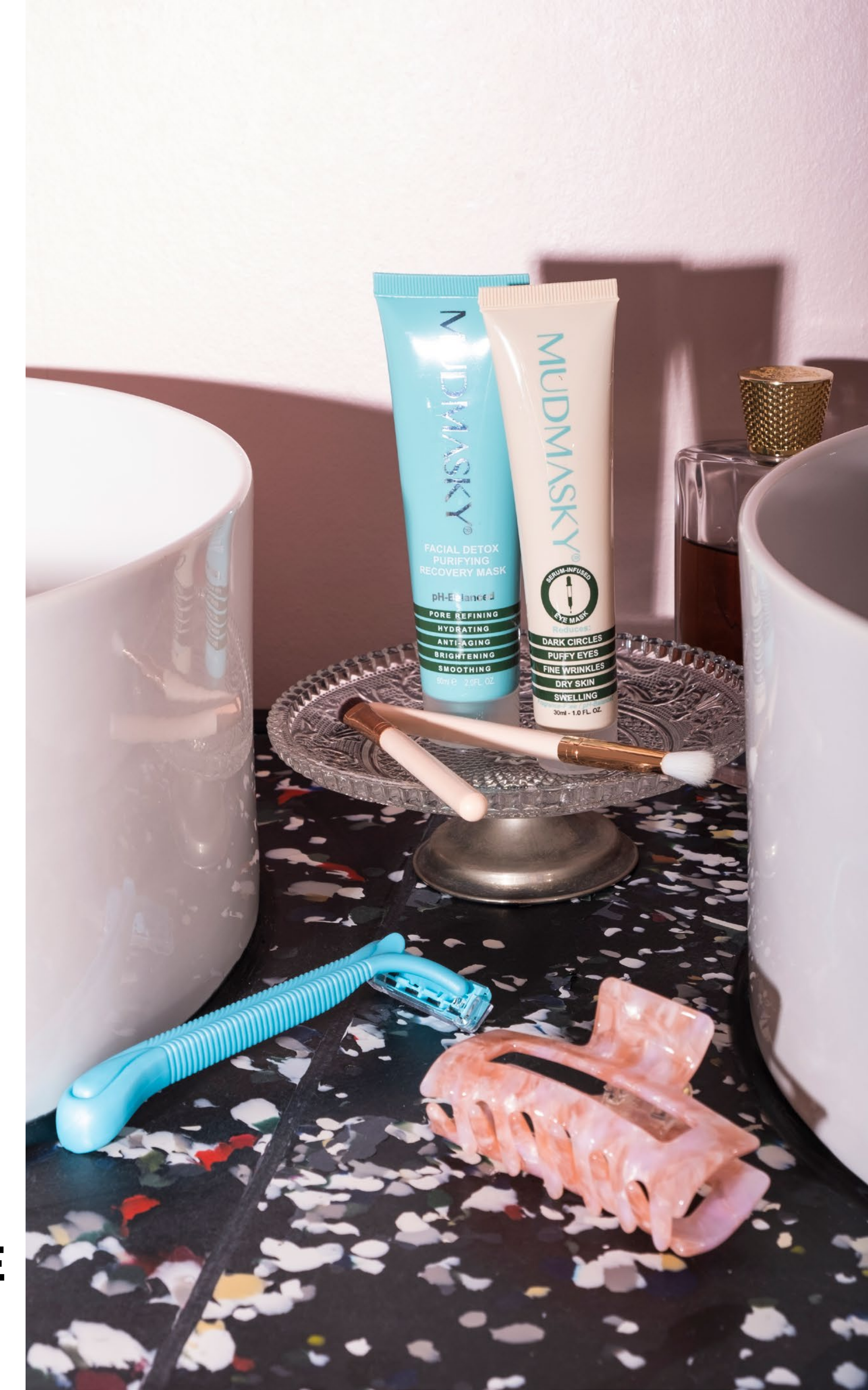
MUDMASKY PRODUCT PALETTE (2023)